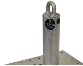
1 CB-12 & CB-18