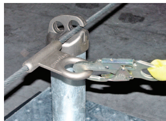
3 Attached Slider

Pass-Thru top allows for cable lifeline or direct attachment.