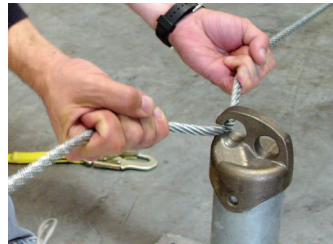
2 Pass-Thru Top

Pass-Thru top allows for cable lifeline or direct attachment.